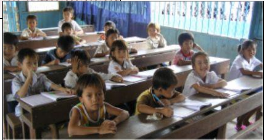
A floating school on the river

Having travelled in the Cambodian traffic, I better understand why Rev Tin asked for prayer. The traffic there is very different to Australia and the road rules are very, shall we say . . . relaxed.